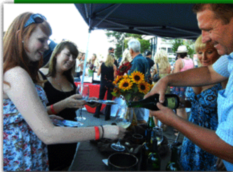
Tasters at Mt. Konocti Growers Booth

Giant sized thank yous are in order for more than 150 selfless and dedicated people for volunteering to put on the Taste of Lakeport this year.